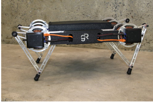
(a) photo of Minitaur quadrupedal robot

We will present empirical results involving the Minitaur that test the extent to which the candidate models describe the robot's behavior. If there is a statistically significant difference between the models' descriptive power, we will quantify and report on the observed differences. If we do not observe statistically significant differences between predictions from the two models, we will conclude that the more computationally-amenable decoupled-limb model can be used with confidence in future work involving optimization and learning.